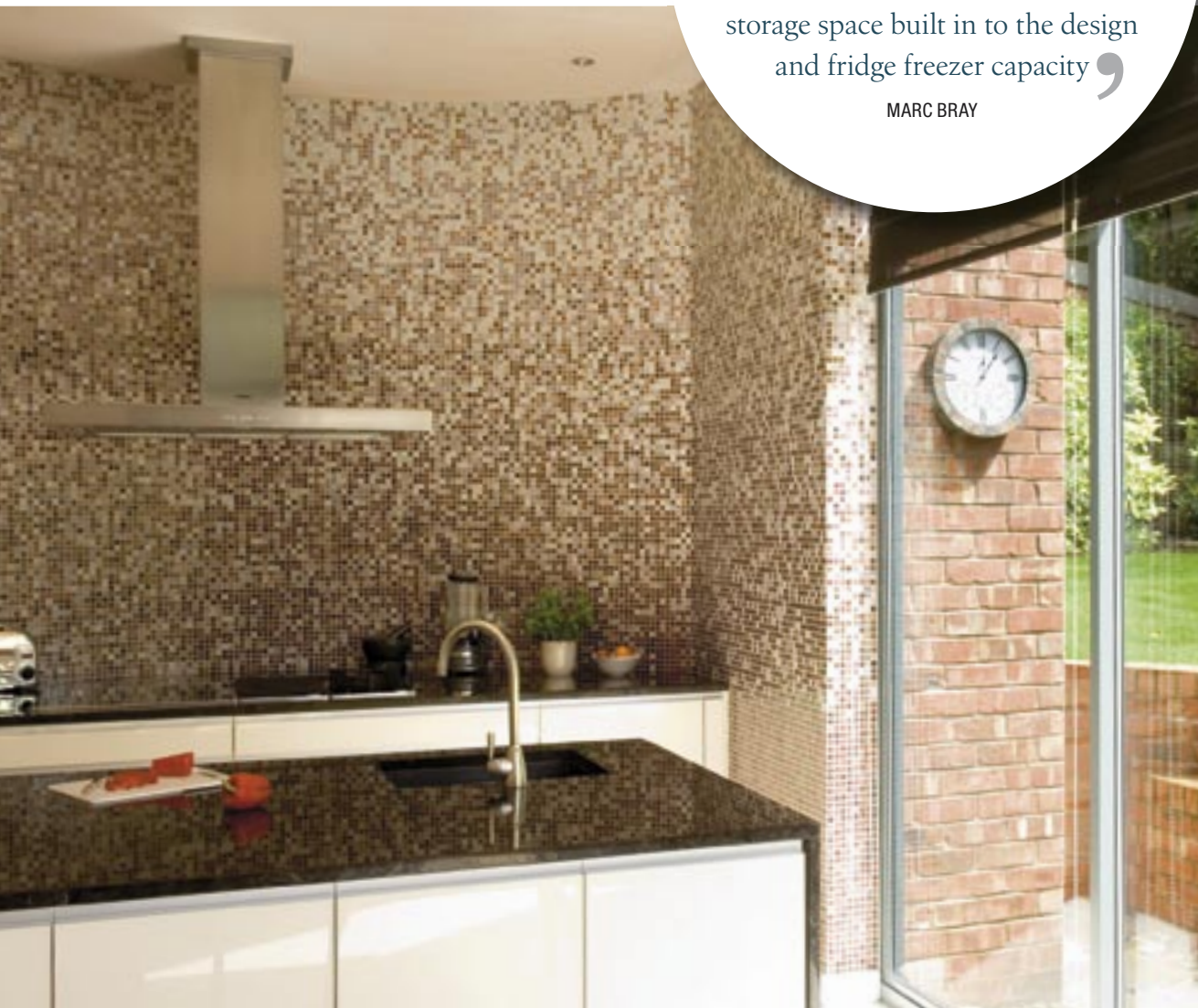
◀ A feature wall made with Calicanto mosaic tiles from Bisazza creates an unusual talking point in Marc and Keith's kitchen. The stainless-steel extractor has been hung from the ceiling to minimise interruption of the room's overall design