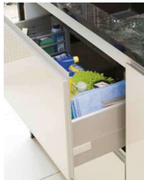
Dedicated drawer storage for cleaning products and cloths has been integrated under the striking Antique Brown granite worktops to keep the surfaces clutter-free and tidy